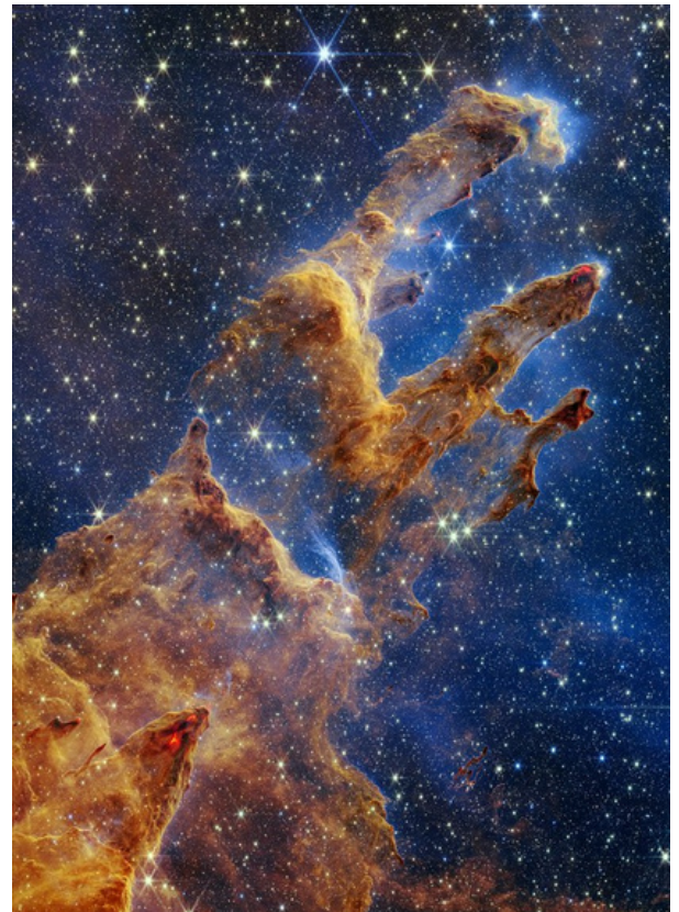
"The Pillars of Creation" by James Webb Space Telescope is licensed under CC BY 2.0 .

At our CC Global Summit, participants drafted community-driven principles on AI that are a valuable input and will help inform the organization's thinking as we determine CC's exact role in the AI space.